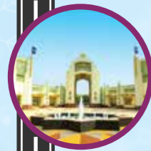
RAMOJI MOVIE MAGIC